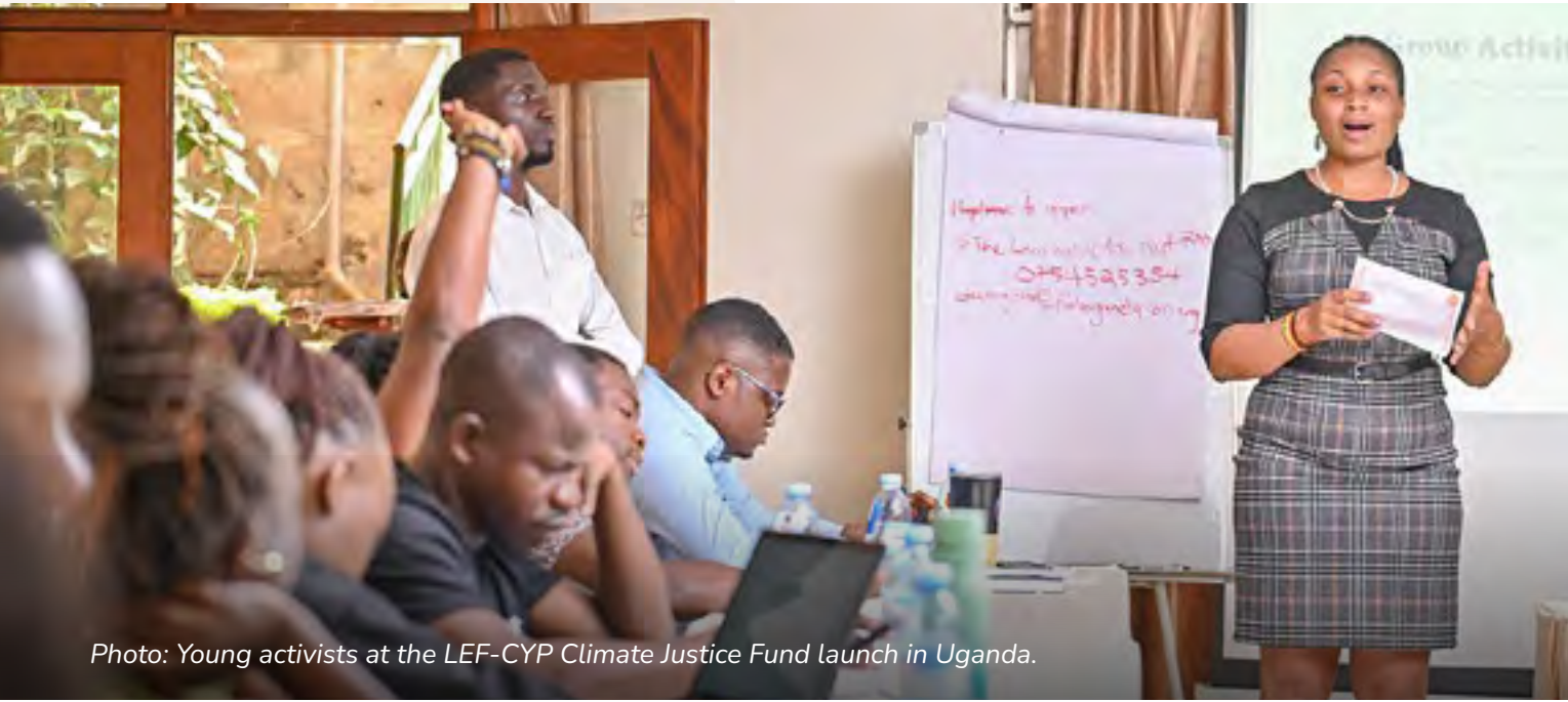
Photo: Young activists at the LEF-CYP Climate Justice Fund launch in Uganda.

In Africa, communities find themselves on the front lines of climate change, though they bear the least responsibility. The Legal Empowerment Fund (LEF) partnered with FGHR’s Children and Youth Rights Program (CYP) to fund scoping studies on the opportunities and challenges young climate activists face in six countries—Benin, Guinea-Bissau, Liberia, Senegal, Sierra Leone, and Uganda—and fund $1 million in grants to 41 youth-led groups. The activists will harness the power of youth mobilization and legal empowerment to advance community-led responses to the climate crisis.