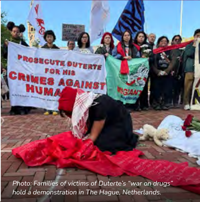
Photo: Families of victims of Duterte’s “war on drugs” hold a demonstration in The Hague, Netherlands.

Years of steadfast funding enabled Filipino activists to support the families whose loved ones were killed during former president Rodrigo Duterte’s brutal anti-drug campaign, which claimed up to 30,000 lives. Despite relentless persecution, grantee partners worked with victims’ families to seek justice. In March 2025, Duterte’s arrest on an ICC warrant demonstrated how long-term investment can empower activists to be ready when opportunity arises.