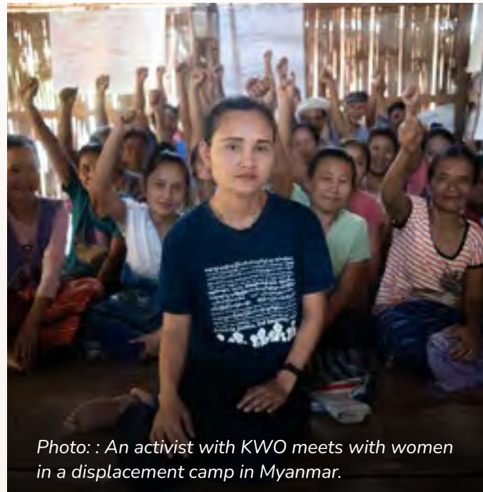
Photo: : An activist with KWO meets with women in a displacement camp in Myanmar.

In early 2025, funding freezes threatened food aid and basic services for over 100,000 refugees in displacement camps along the Myanmar-Thai border, with monthly rations dropping from $7 to just $2.50 per adult. FGHR's flexible support enabled grantee partner Karen Women's Organization (KWO) not only to rapidly reallocate funds to meet urgent needs, but also to secure a critical policy shift that expanded refugees' legal access to employment. We also raised an additional $20,000 in emergency aid.