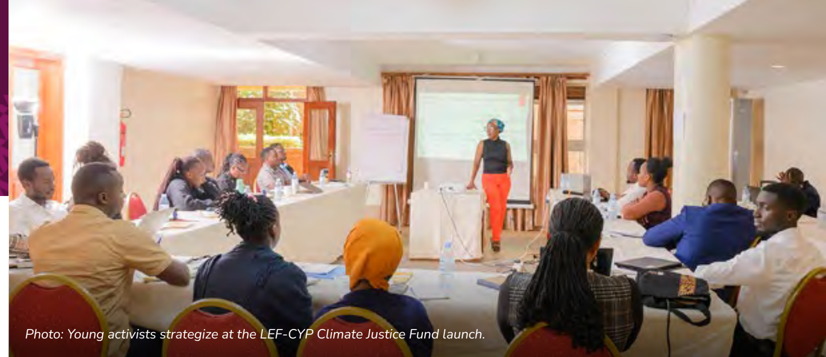
Photo: Young activists strategize at the LEF-CYP Climate Justice Fund launch.

US and UK Entities Consolidated Statement of Activities Year Ended June 30, 2025